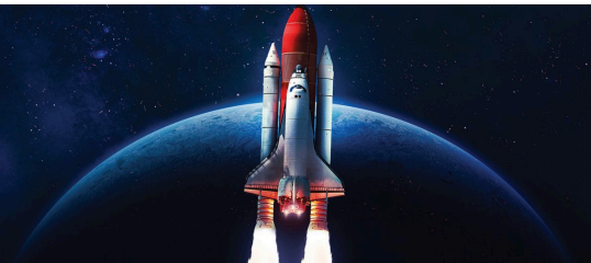
NASA's Space Shuttle Orbiter Columbia

The basic requirements to join NASA are a bachelor's degree in space sciences, geology, math, engineering, or a similar field. 3 years of engineering or 1,000 hours of flying, and to pass the NASA Astronaut Physical Examination Test. Personally, the hardest part in all of this is Engineering, specifically where. I would like to get into Harvard to start my college education for NASA. Space Science would be my top choice for majors because they are number two for their space science programs which gives me hope of getting into NASA someday.