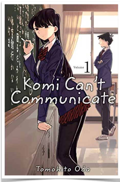
Komi Can't Communicate A comic by Tomohito Oda